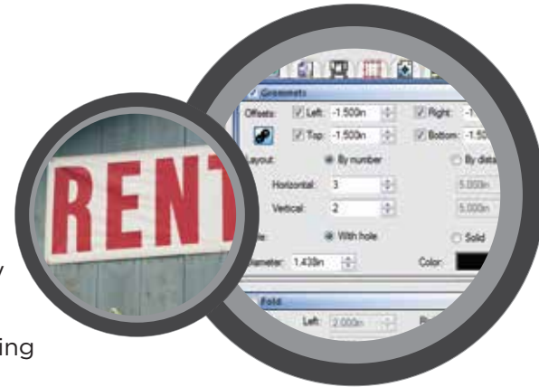
Banner & Canvas Finishing Tools