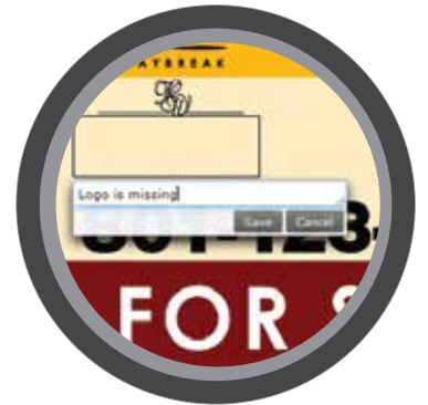
Automated Artwork Approval Tool